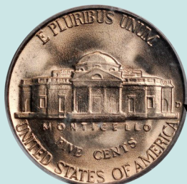
Mint Mark 1938– 1966