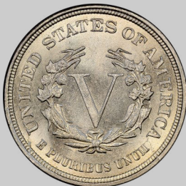
No Cents Reverse