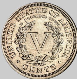
With Cents Reverse