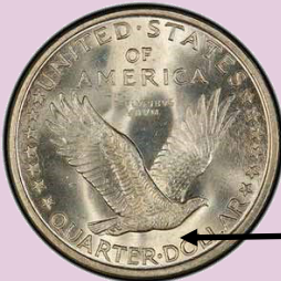
Type 1 No Stars