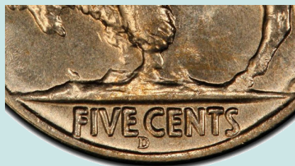
1936 D 3 1/2 Leg