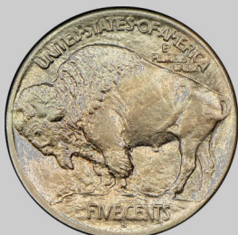
Type 1 Reverse