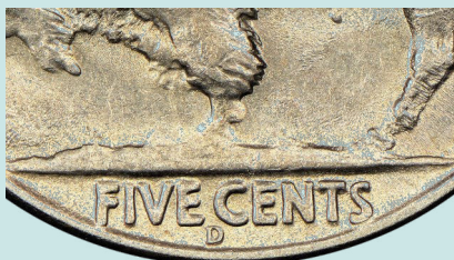
1937 D 3 Leg

The two varieties shown above are heavily counterfeited. Some counterfeits are created by altering normal 1936 D and 1937 D nickels, others are later reproductions.